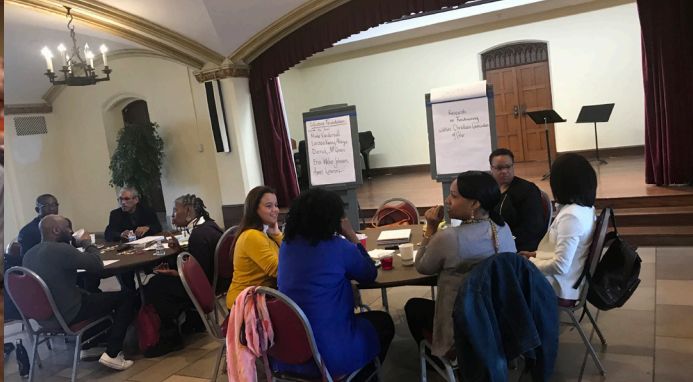
Research gathering session at the first meeting of the Collective Foundation at Riverside Church in NYC.