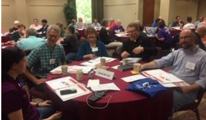
The Diocese of Fond du Lac plans for Project Resource “roll-out” in the Diocese following the conference.